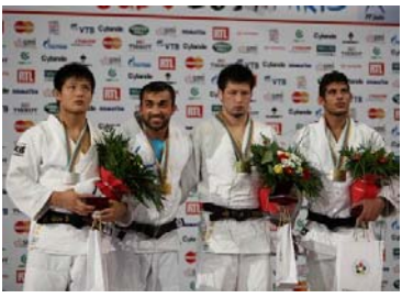
The 90kg podium, Iliadis 2nd left