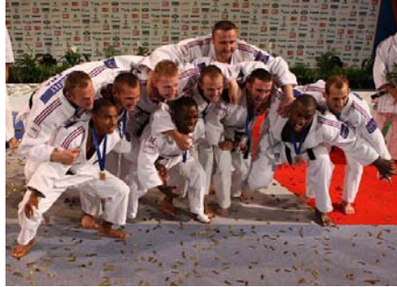
The French mens team celebrate their win