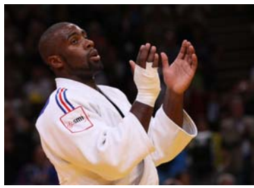
Teddy Riner was at his best

The Stars It is impossible to go past Teddy Riner (FRA) as the star of the show. Not only did he win all six fights in his +100kg category, all of them were by ippon, and all with different techniques. As if that weren't enough, he came into the final of the team event with the scores at 2-2 with Brazil, and took the fight in golden score to give his team the title.