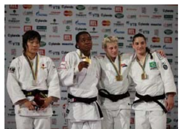
Womens 78kg podium

Rishod Sobirov (UZB) showed why he was named the best male judoka of today by winning the 60kg in style, defending the title he won in Tokyo. His speed and athleticism is something to behold. In the final he despatched rival Hiraoka (JPN) with kosotogake for waza-ari.