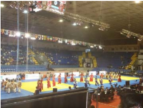
The colourful opening ceremony

This year was the first time that Australia had sent a team of athletes to compete in such a high competition. This event was held in the capital city of Ukraine, Kiev. It was held in a large sporting complex which had 4 competition mat areas. The tournament was very popular, and attracted a large number of spectators.