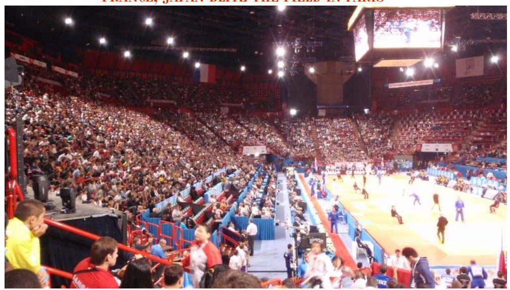
Bercy stadium—scene of the 2011 World Championships