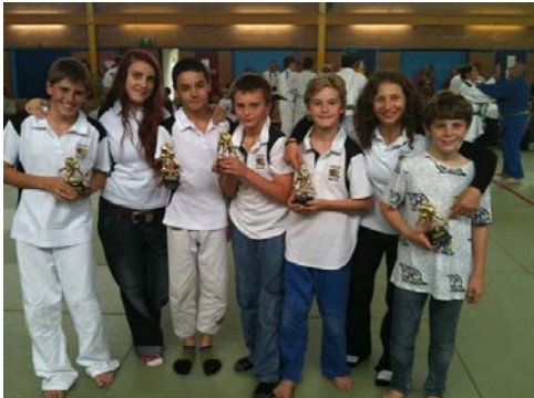
The boys show off their trophies