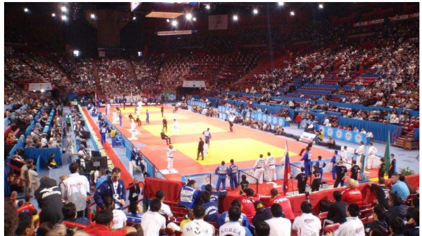
The team competition under way

So it was all over once again...time for many to celebrate, and for others to reflect. The race for Olympic positions now really hots up over the final year, and the results in Paris show that there will be more surprises along the way.