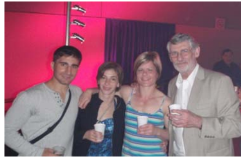
The UNSW group enjoy some socialising