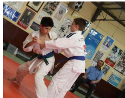
Above and below—some of the action

UNSW had 8 athletes who competed in the Junior Boys and Girls divs (U/12yrs) of this tournament. Many were competing for the first time and all gained from the experience. Some of them found themselves coming up against state team level competitors, and acquitted themselves very well.