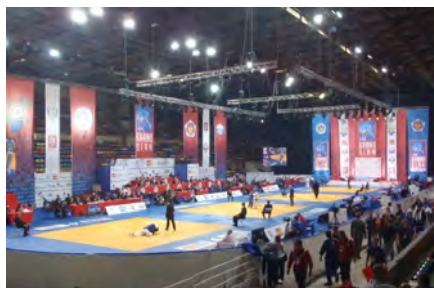
Moscow Grand Slam