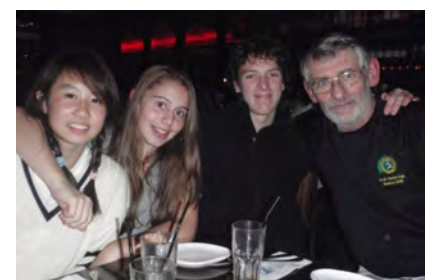
Time to relax after all the hard work

Having all our fighting on Saturday left the evening free for some relaxation – a fitting end to a very satisfying weekend with some very good performances from our athletes.