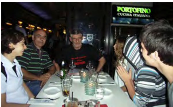
Team dinner in Auckland