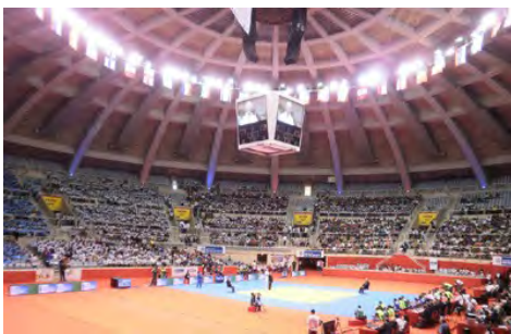
The magnificent stadium for Grand Slam Rio