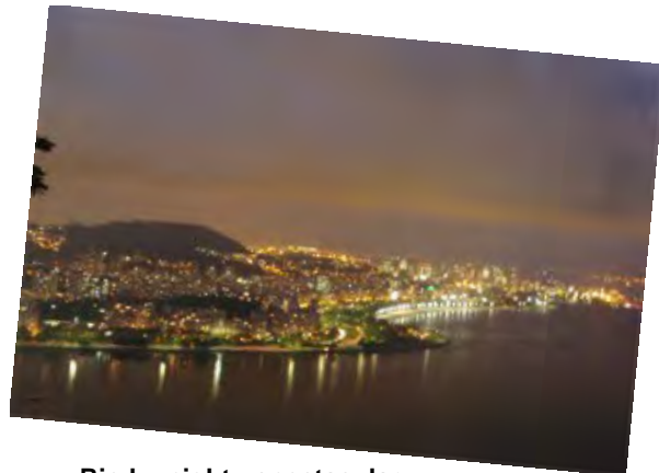
Rio by night - spectacular