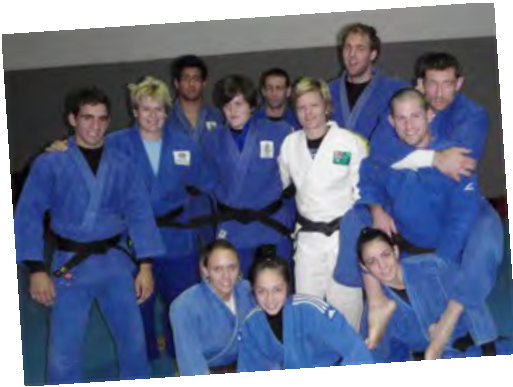
Aussie team in Rio