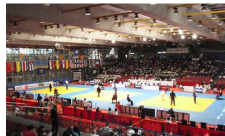
World Cup venue Sao Paulo