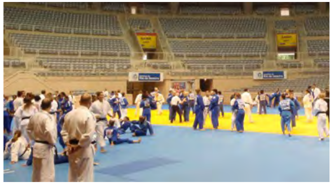
Big numbers at Rio training camp