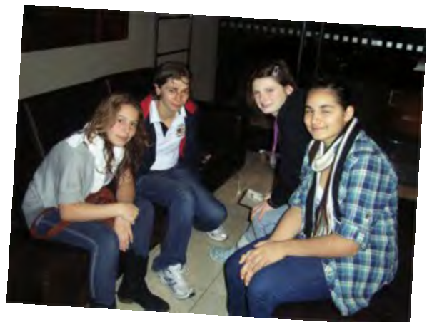
The girls ready to relax

??? WANT THE LATEST JUDO NEWS & CLUB ACTIVITIES ???