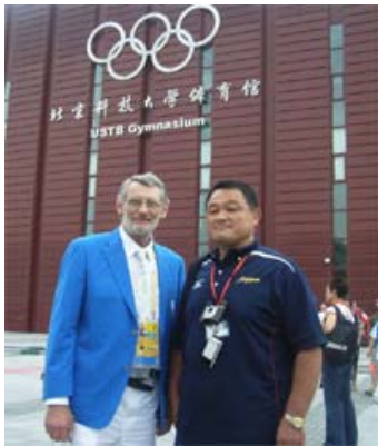
With legendary Yasuhiro Yamashita outside the judo venue