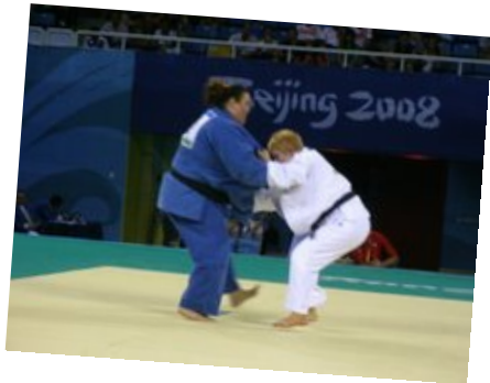
..and is dwarfed by Ramadan (EGY)