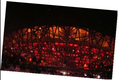
The "bird's nest" sparkles on opening night