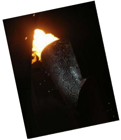
The Olympic Flame is lit