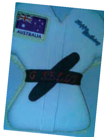
Gav's cake - tasted as good as it looked!