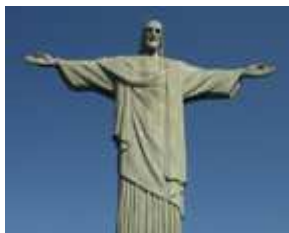
Rio's famous Corcovadia looks down on the city

First impressions of Rio are the sunshine, lines of sandy beaches (said to be badly polluted) Traditional Portuguese architecture, and incredible steep rocky peaks seeming to rise from the very streets. A spectacular place, but dangerous for the unwary tourist – one of the Slovakian athletes being robbed at knifepoint the day before his competition.