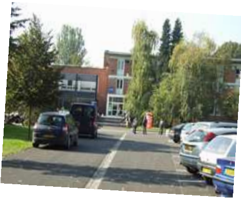
The residence at CREPS Strasbourg