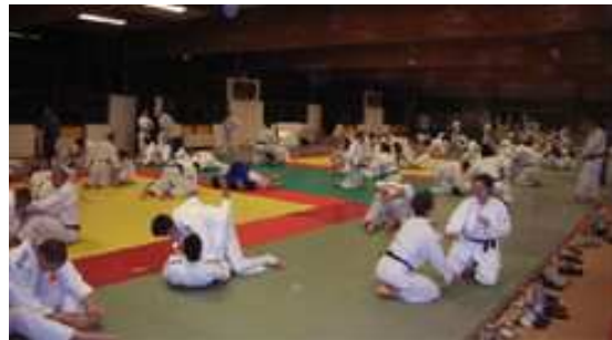
CREPS Training sessions in progress—up to 150 players on the mat!