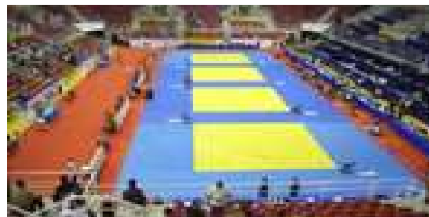
The impressive competition hall - pity the organization didn't match

So, after a shaky start, JPN emerged as the top nation with most medals, thanks to three gold on the last day. Host country BRA was next, also with three gold. FRA scraped into third place, and will be disappointed at some of their stars.