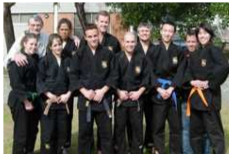
UNSW's line up for the Teams event