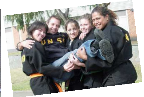
Coaching isn't always hard work