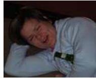
Armed and dangerous

One day the true story will be told of the frolics undertaken by some of our club members following VIOC this year. "What goes on tour stays on tour" !!